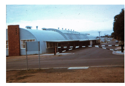
3 RTB Singleton Barracks